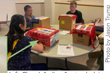
Left: Chaco's "eclipse" petroglyph in thermoform tactile art. Other tactiles include NASA & <u>HAO images</u>.